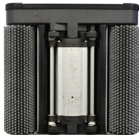
Counter-rotating brushes apply solution and lift dirt at the same time

Innovative recovery system for moisture removal