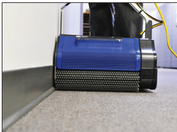
Unique design allows you to clean right up to the wall

Innovative recovery system for moisture removal