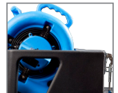
only 26" tall with an air mover installed