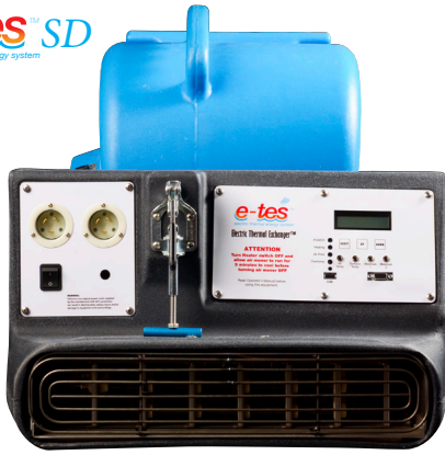
120 volt shown, also available in a 240 volt version

E-TES SD Low-Profile 120V #MB120LP $2,395