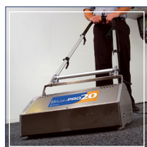
Brush Pro Cleaning

Spray mixture lightly over an absorbent bonnet and over a section of the floor to be cleaned. Place bonnet under rotary machine and move over area until clean. Change bonnets frequently and place in plastic bag to keep moist until laundered. For use with medium to heavy soil.