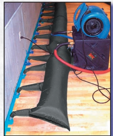
Able to get sub-floor and inside walls