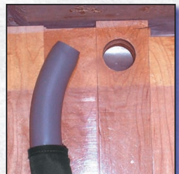
1" diameter ports