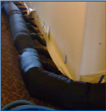
Goes around corners