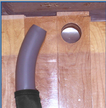
1" diameter ports