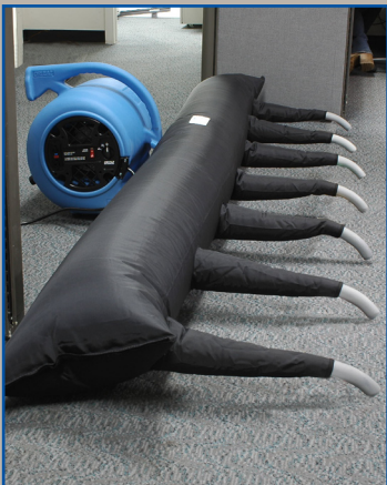
Able to get sub-floor and inside walls