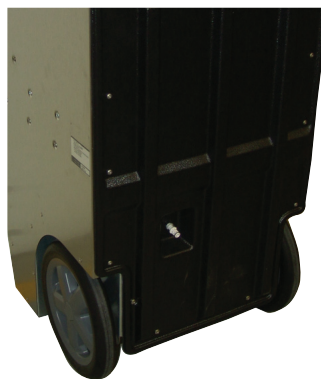
A skidplate protects the Phoenix 270HTx from damage while loading and unloading, and in transport.