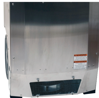
The Phoenix 270HTx features a sleek body style with chamfered corners for maneuverability in its legendary stainless steel cabinet.

Below 50°F – When the Phoenix 270HTx is used in very cool operating temperatures (below 50 °F), frost will form on the evaporator coil as it dehumidifies. When enough frost forms the solid state controls will initiate a defrost cycle. The defrost cycle periodically turns off the compressor while allowing the blower to run. The automatic bypass door will remain closed in this operating range. Increased airflow and static pressure will help defrost the evaporator more quickly and efficiently.