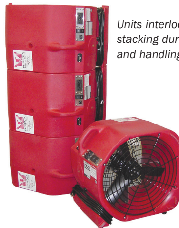
Units interlock for ease of stacking during storage and handling.