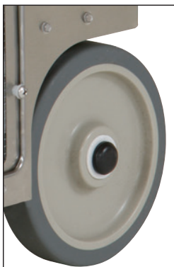
Inboard wheels allow for tighter storage and improve maneuverability.

The design of the Phoenix Arctic Max reflects our restoration expertise in its size, shape, functions and features. The stainless steel cabinet and durable construction are Phoenix trademarks. The integrated cart design and recessed wheels promise easy maneuverability, transportation, and storage. Set-up and operation is simple using the Phoenix window accessory kit, and a 15 amp outlet. The Phoenix Arctic Max also features filter efficiency options up to MERV-11, an internal condensate pump with 30 foot drain hose and 20 foot power cord. The Phoenix Arctic Max promises years of service and our "proven" performance.