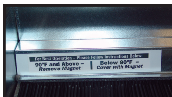
Bypass closed (normal temperature operation).

Below 90°F - When the Phoenix 200 HT is used in normal or cool operating conditions (below 90°F), additional airflow across the evaporator increases performance by increasing the amount of air that is dehumidified. Covering the bypass openings with the magnet is recommended.