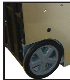
Inboard wheels allow for tighter storage and improve maneuverability.