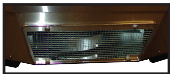
Downward-focused air exhaust directs low-grain air toward the floor.

The downward-focused exhaust airflow directs dehumidified low-grain air toward the floor, while a raised base improves drying directly under the dehumidifier. The Phoenix 200 HT also features a recessed condensate outlet, inboard wheels, increased airflow with