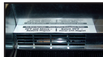
Bypass open (high temperature operation).