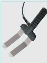
MO290-BP Moisture Baseboard Probe