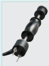
MO290-HP Moisture Hammer Probe