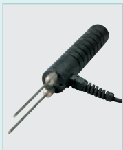
MO290-EP Moisture Extension Probe