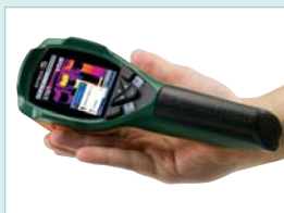
Pocket size and extremely lightweight camera only weighs 12 ounces