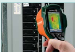
Detect hidden problems fast