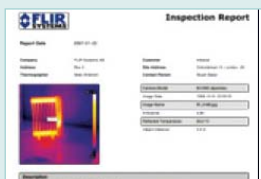
QuickReport™ PC software enables user to analyze Temperature of all JPEG images from miniSD™ card