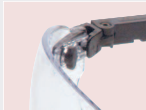
Patented lens inclination system for a customized fit.