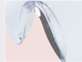
Molded-in nose bridge.