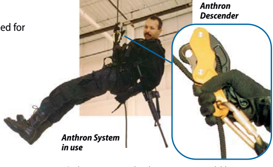
Anthron systems and replacement ropes available in lengths of 25-ft increments from 50 ft up to 600 ft \,