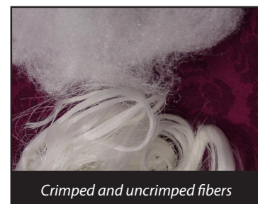
Crimped and uncrimped fibers

Cleaning temps that are safe for other synthetics are suitable for polyester. So, is there any 'bogeyman' to watch out for? Definitely, yes. Despite engineered in performance improvements in recent years, polyester is still not as resilient as nylon and is also prone to crimp loss. Over time, traffic stretches the fibers removing the crimp that provided bulk and loft. The stretched out fiber now looks flat and lifeless. Colors lose their boldness. Cleaning cannot correct this. Be sure to adjust customer expectations accordingly.