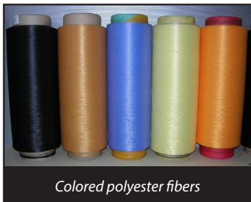
Colored polyester fibers

As with other synthetic carpet fibers, polyester is relatively resistant to abrasion, resistant to damage from most chemicals likely to come in contact with a carpet, and resistant to mold.