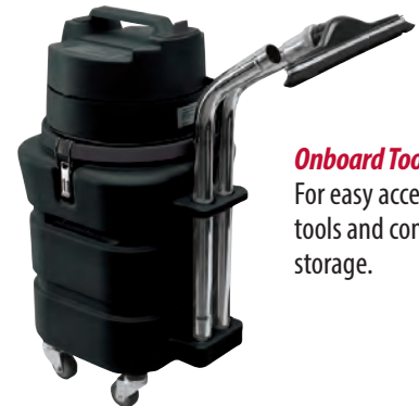
Onboard Tool Holder: For easy accessibility to tools and convenient storage.

The HEPA filter is individually tested and certified to be 99.97% efficient at .3 microns according to IEST-RP-CC001 test requirement.