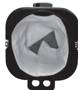
Large Filter Bag: Less time changing out filter bags and maximum capacity. (item #1673-3723)