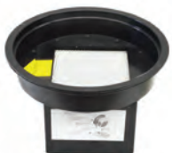
HEPA Filter (item #1688-4569)