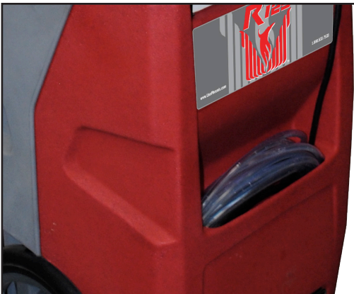
Convenient storage for power cord and drain hose.