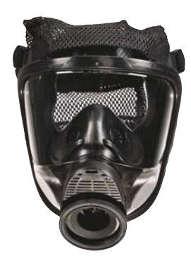
Advantage 4000 Facepiece