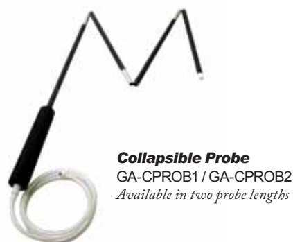
Collapsible Probe GA-CPROB1 / GA-CPROB2 Available in two probe lengths