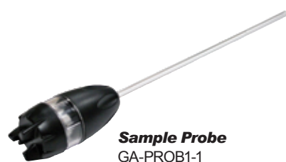
Sample Probe GA-PROB1-1