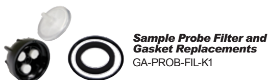
Sample Probe Filter and Gasket Replacements GA-PROB-FIL-K1