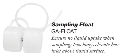
Sampling Float GA-FLOAT Ensure no liquid uptake when sampling; two buoys elevate hose inlet above liquid surface.