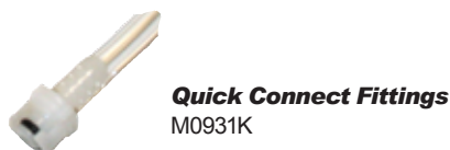
Quick Connect Fittings M0931K