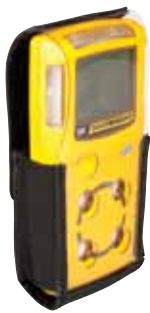
Black Leather PVC case MC2-LC-1

*For regions outside North America replace “-NA” with: “-EU” for Europe, “-UK” for United Kingdom and “-AU” for Australia/China.