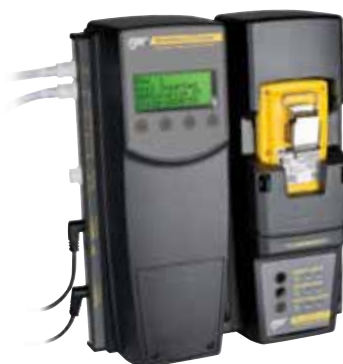
MicroDock II Automatic test and calibration station (see MicroDock II section for additional information)