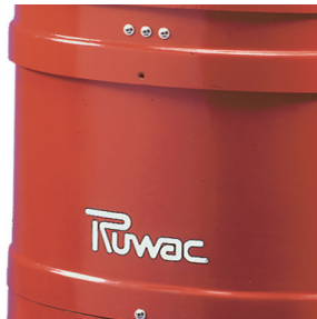
Fiberglass reinforced housing