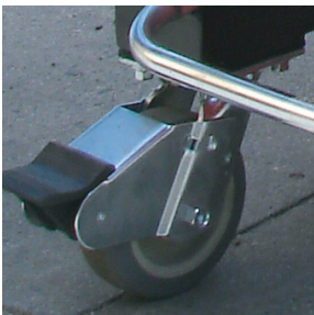
Heavy duty self-locking casters