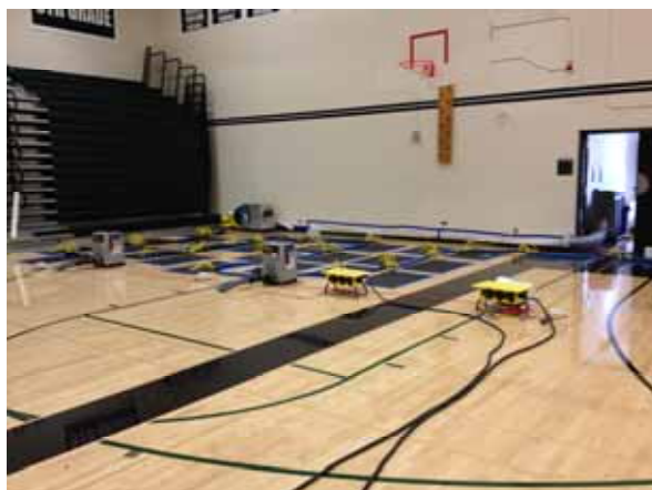
Floor drying set-up shows HP system using a variety of panels