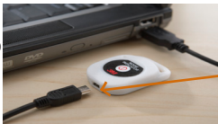
External port of NI-100