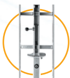
1 Rotary Exit