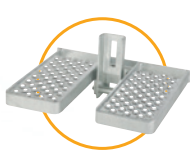
2 Foldable Foot Rests