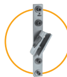
4 Exit Section

GlideLoc offers a full range of system components designed to meet the needs of complex applications.