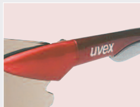
Bold temple design delivers attention-getting style.