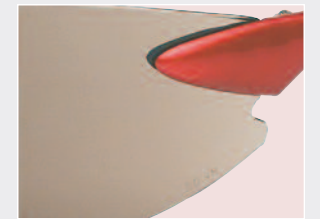
Nine-base, wrap-around lens design provides close-to-the-face protection and superior coverage.