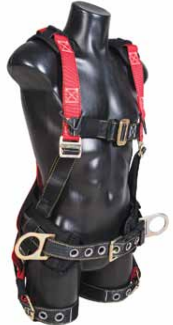
Seraph Construction (11173)