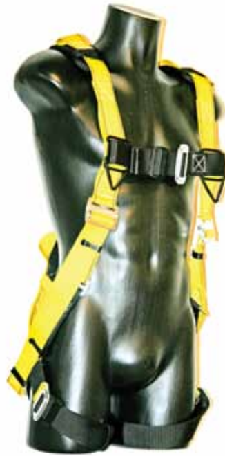
Seraph HUV (11160)