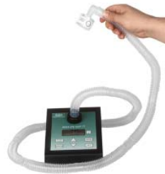
ZBP-310 Remote Extension shown attached to Bio-Pump®