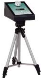
ZA0043 Heavy Duty Tripod Sampling Stand