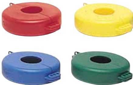
VS04 in various colors