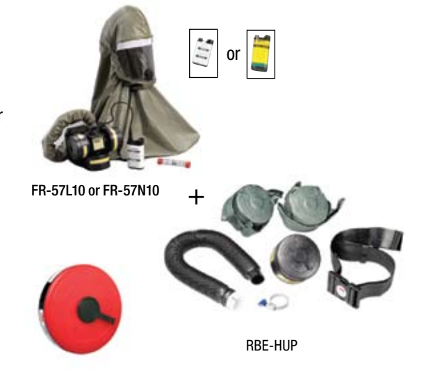
3M™ Training Cartidge RBE-TRN