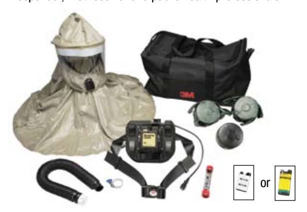
for Responders PAPR Systems RBE-L10 and RBE-NM10

These National Institute for Occupational Safety and Health (NIOSH) approved powered air purifying respirator systems help provide protection against Chemical, Biological, Radiological and Nuclear (CBRN) particulates, gases and vapors. Uniquely designed for first responder, first receiver and public health professionals.