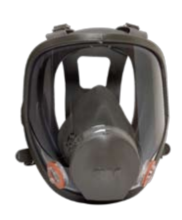
6000 Full Facepiece