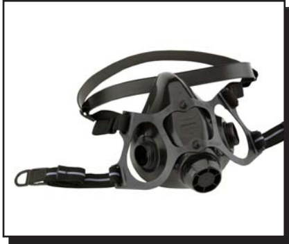
North 7700 Series Half Mask "The industry standard"