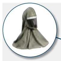
Butyl Rubber Hood