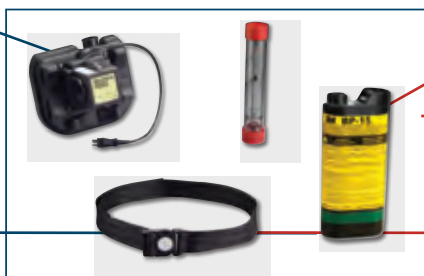
3M™ Breathe Easy™ Turbo Assembly