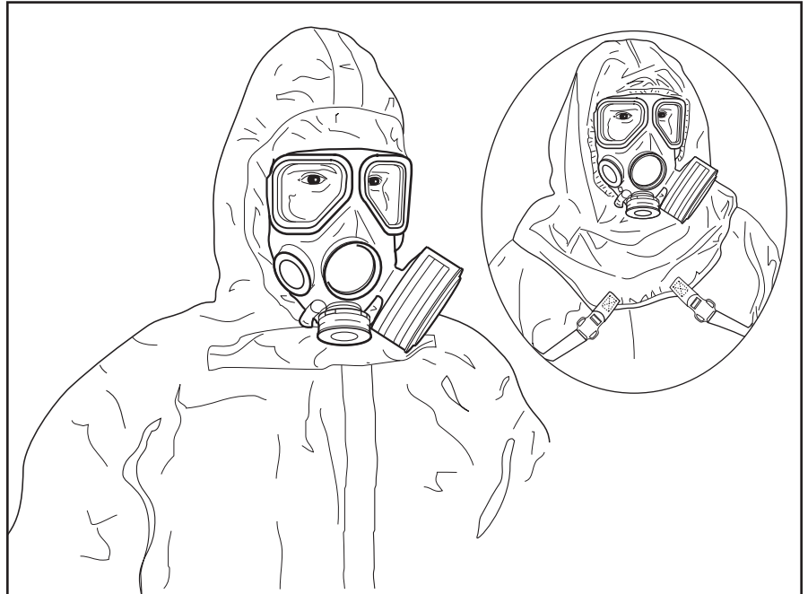
3M™ Full Facepiece FR-M40 with Cartridge FR-C2A1 and FR-64