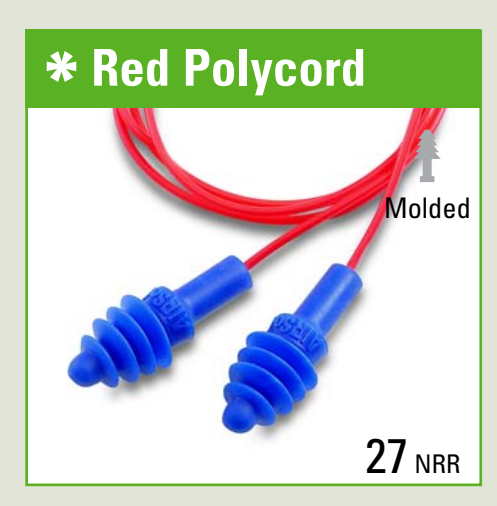
DPAS-30R Flip-Top Box | AS-30R Safety Impact Case