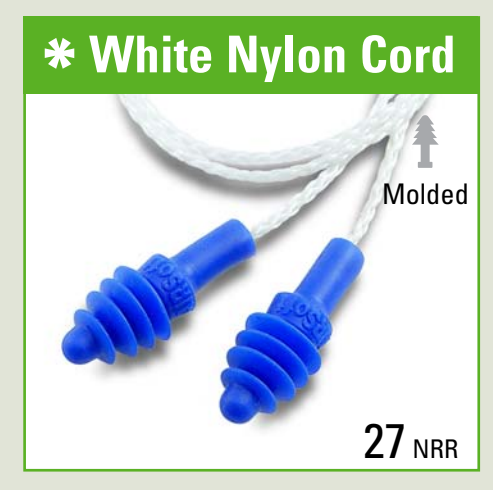
DPAS-30W Flip-Top Box | AS-30W Safety Impact Case