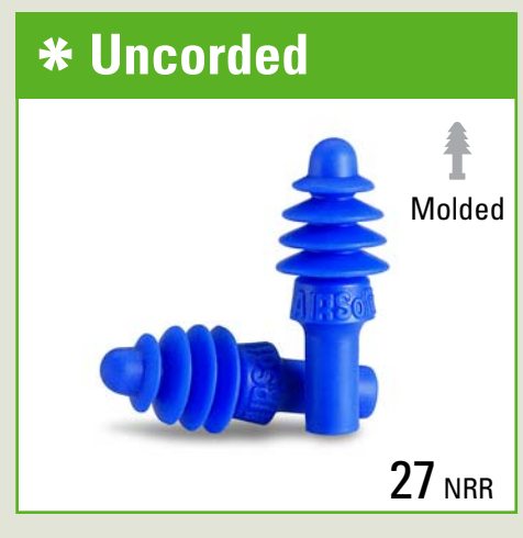
DPAS-1 Flip-Top Box | AS-30 Safety Impact Case

More information available at www.hearingportal.com