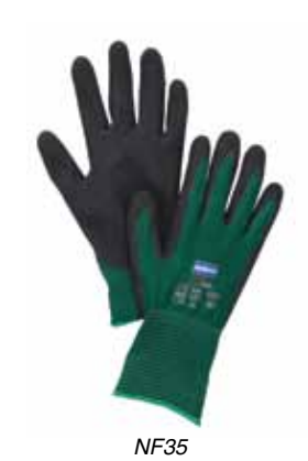
NORTH by Honeywell