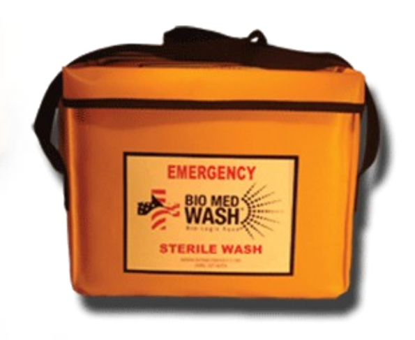
Part # 47095