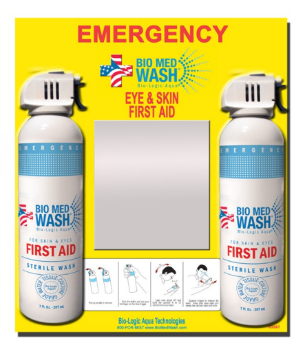
Part # 47085