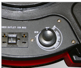
Variable Speed Control