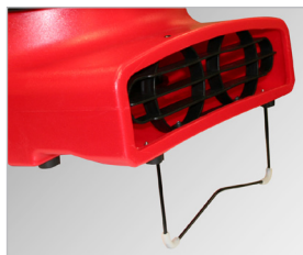
Built-in Kick Stand