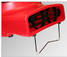
Built-in Kick Stand