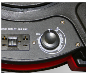
Variable Speed Control