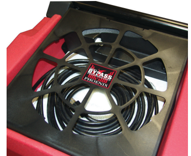
Convenient storage for power cord and drain hose.

The R250 marks Phoenix Restoration Equipment's continuing commitment to technology, performance and durability.