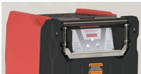
Telescoping handle retracts to make unit compact for transport and storage.