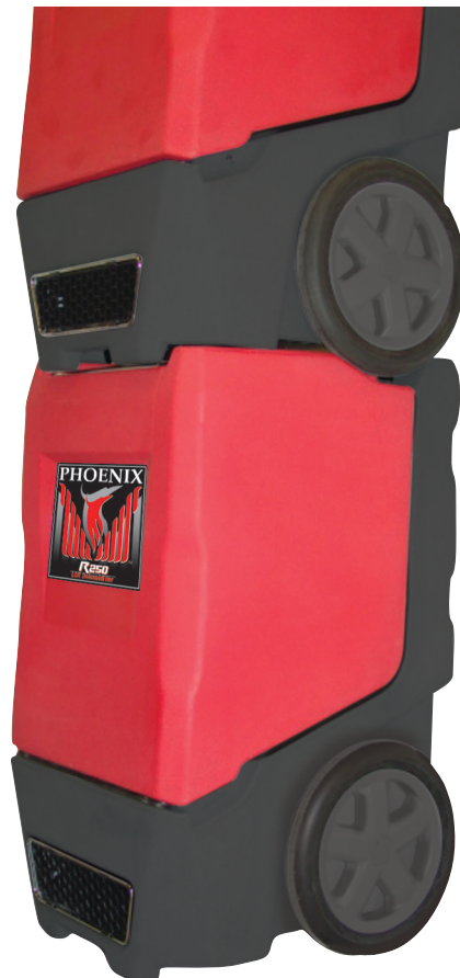
Units stack upon themselves for easy storage.