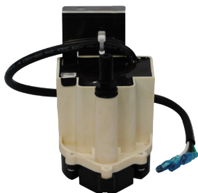
Heavy-Duty Condensate Pump