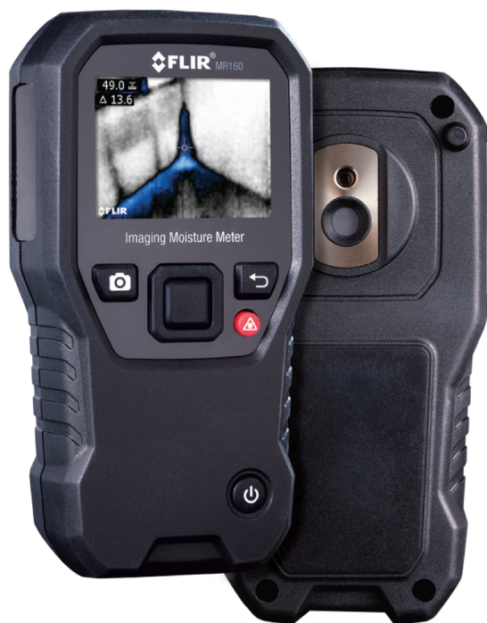
MR160 Imaging Moisture Meter