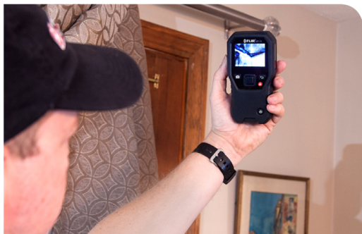
FLIR MR160 scanning ceiling & wall joint for moisture issues.