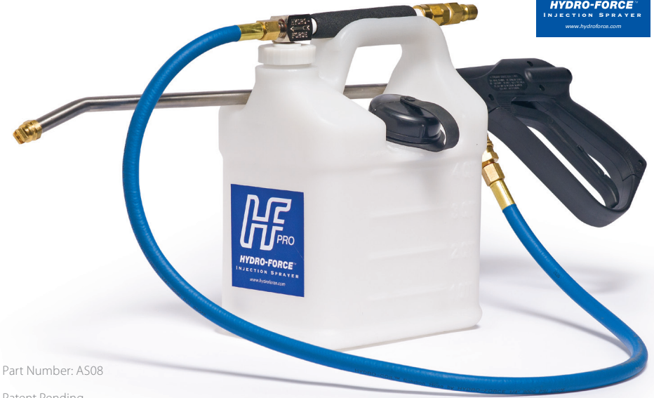
Part Number: AS08