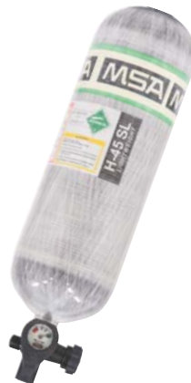
10127945-SP H-45 SL, SuperLite Carbon