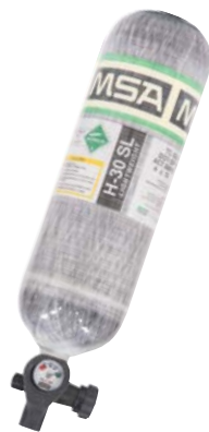
10127944-SP H-30 SL, SuperLite Carbon