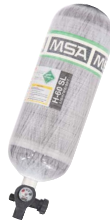
10127946-SP H-60 SL, SuperLite Carbon

Note: This Bulletin contains only a general description of the products shown. While uses and performance capabilities are described, under no circumstances shall the products be used by untrained or unqualified individuals and not until the product instructions including any warnings or cautions provided have been thoroughly read and understood. Only they contain the complete and detailed information concerning proper use and care of these products.