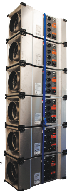
Stack up to 6 units with a strap for storage and transportation