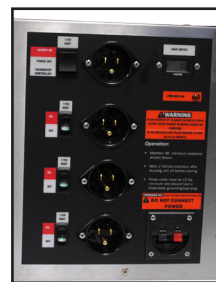
4 - 12 amp circuits Up to 20,000 BTU's