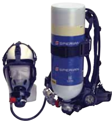
Survivair Cougar SCBA

Honeywell offers pre-configured and stocked SCBAs for ease of ordering. Honeywell SCBAs may also be custom configured to fit your application and needs.